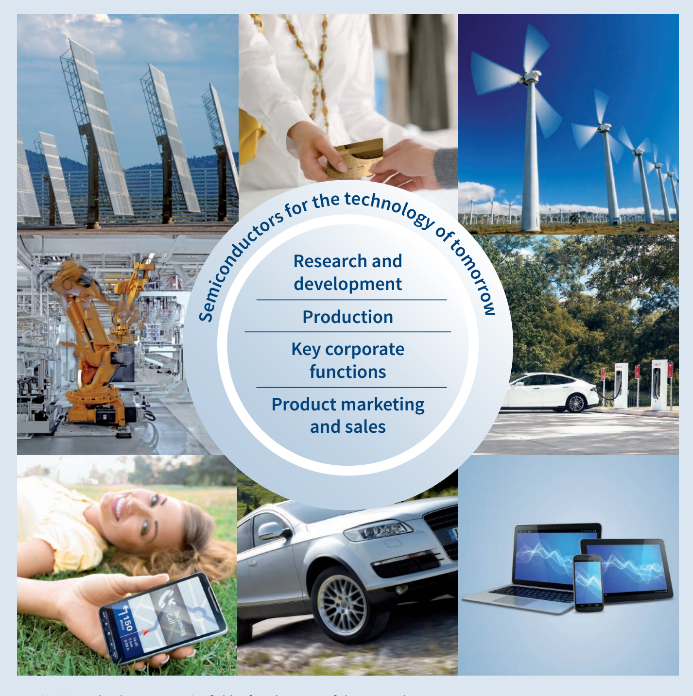
Fascinating technology – Attractive fields of work – State-of-the-art products